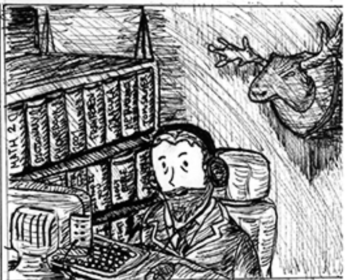
... SURFING THE NET IN ENGLISH.