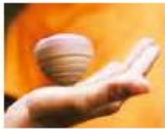
1. spinning top