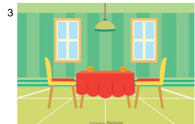
c. GNIDNI OROM