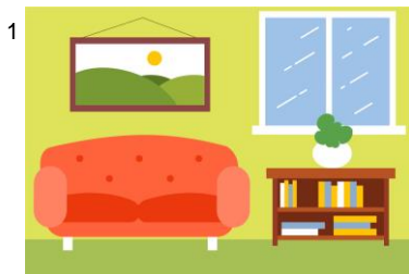
a. IRGLVIN OMRO LIVING ROOM

A. Look at the images and unscramble the letters related to the parts of the house.