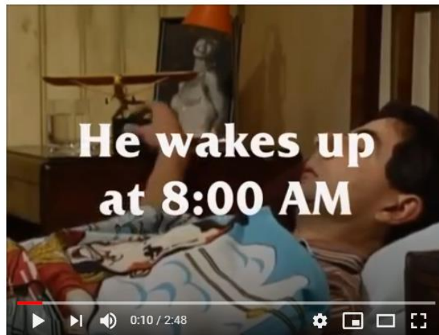
Mr Bean Daily routine Elementary Kids

Follow this URL to watch the video https://www.youtube.com/watch?v=8O8HPvy_4sY