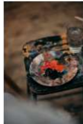
paint or draw