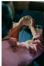
play video games