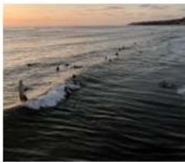
go to the beach