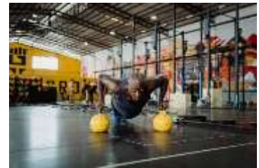
4 Do exercise