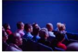
go to the cinema