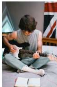
play a musical instrument