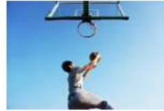
practice a sport