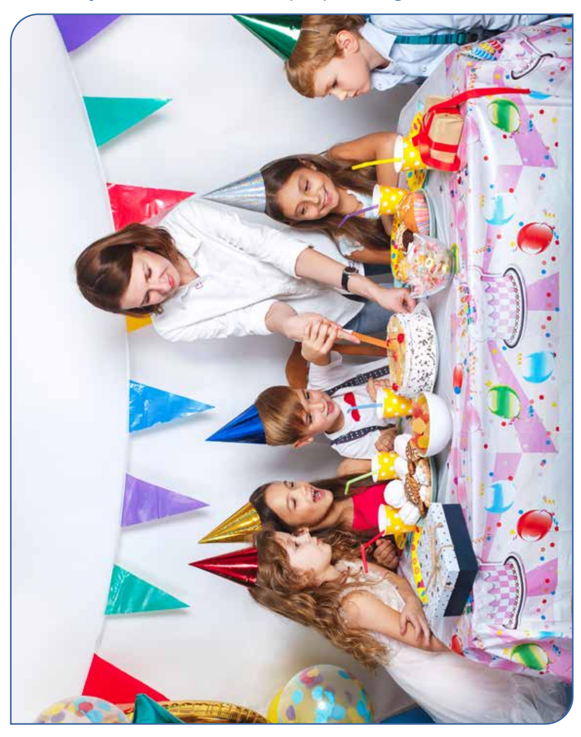
Speaking – A2.1 – Set 2