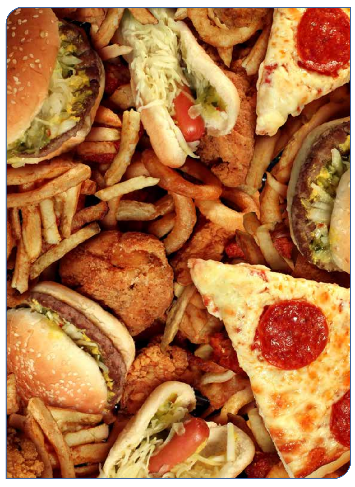
Speaking – A2.1 – Set 1